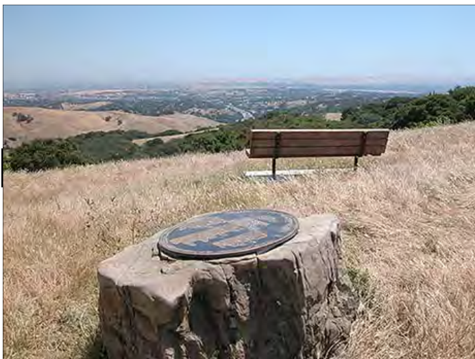
Sky Ranch plaque and bench, at the top of the uphill climb, a good place for a rest.

After leaving the ranch site, the road traverses two folds in the hills. These are not long and deep enough to be arroyos.