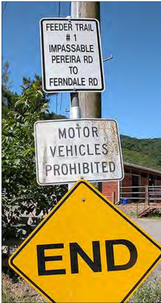
Feeder Trail #1 begins at the end of Dutra Road

of the slope. Poison Oak is everywhere. As the trail climbs out of the arroyo, it rounds a bend to arrive at the gate of Sky Ranch, about one mile from the starting point. Just past the gate, a signboard on the left provides a map of Sky Ranch and explains the role of the Muir Heritage Land Trust, which owns Sky Ranch and Dutra Ranch. The return loop of the hike is across from the signboard. After passing this return loop, hikers should keep to the right at all trail junctions. The road to the top is fully exposed to sun. On hot summer days, it is best to go slow and carry water. Hikers will find the Sky Ranch plaque at the top of the ridge. At this point, almost all the uphill climbing is done. A bench supplies a convenient place to rest and take in the view. Turning to the right, the road passes through a fence line and enters the Dutra Ranch. The road comes to a "Y." The Feeder Trail #1 continues on the left. The return loop through Dutra Ranch is on the right, continuing along the ridge. After about one quarter of a mile, the road takes a long sweeping bend to the right as it heads down hill. The Dutra Ranch site is at the bottom of the bend. A plaque marks the sight and an interpretative sign provides history.